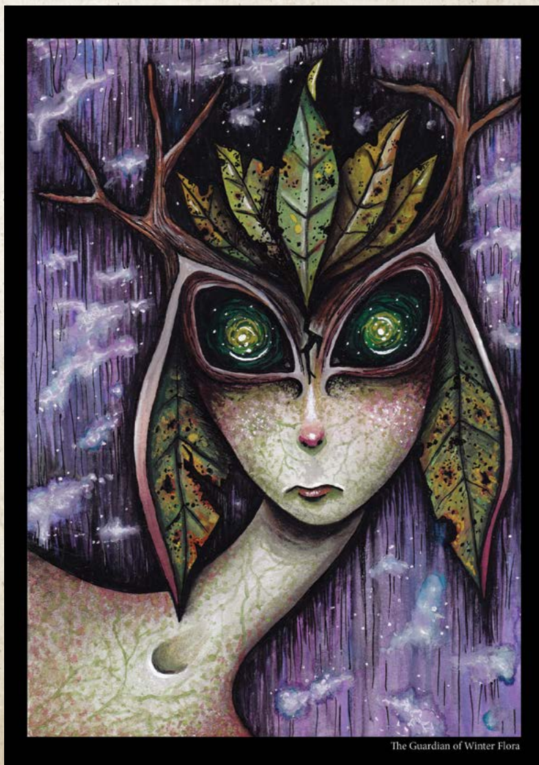
The Guardian of Winter Flora