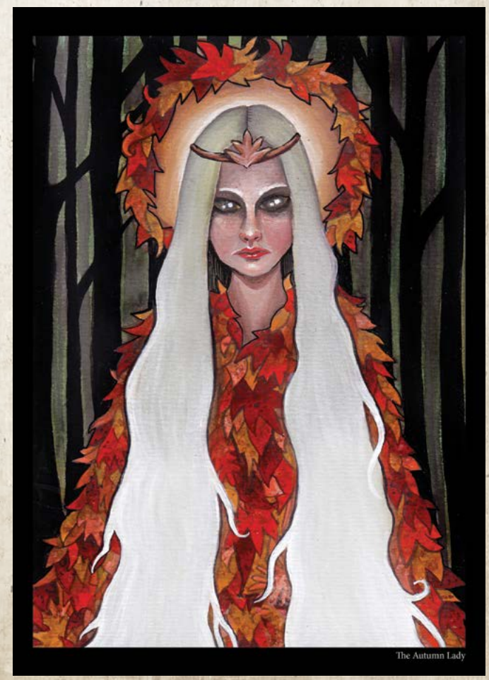
The Autumn Lady by Sabrina RG Raven