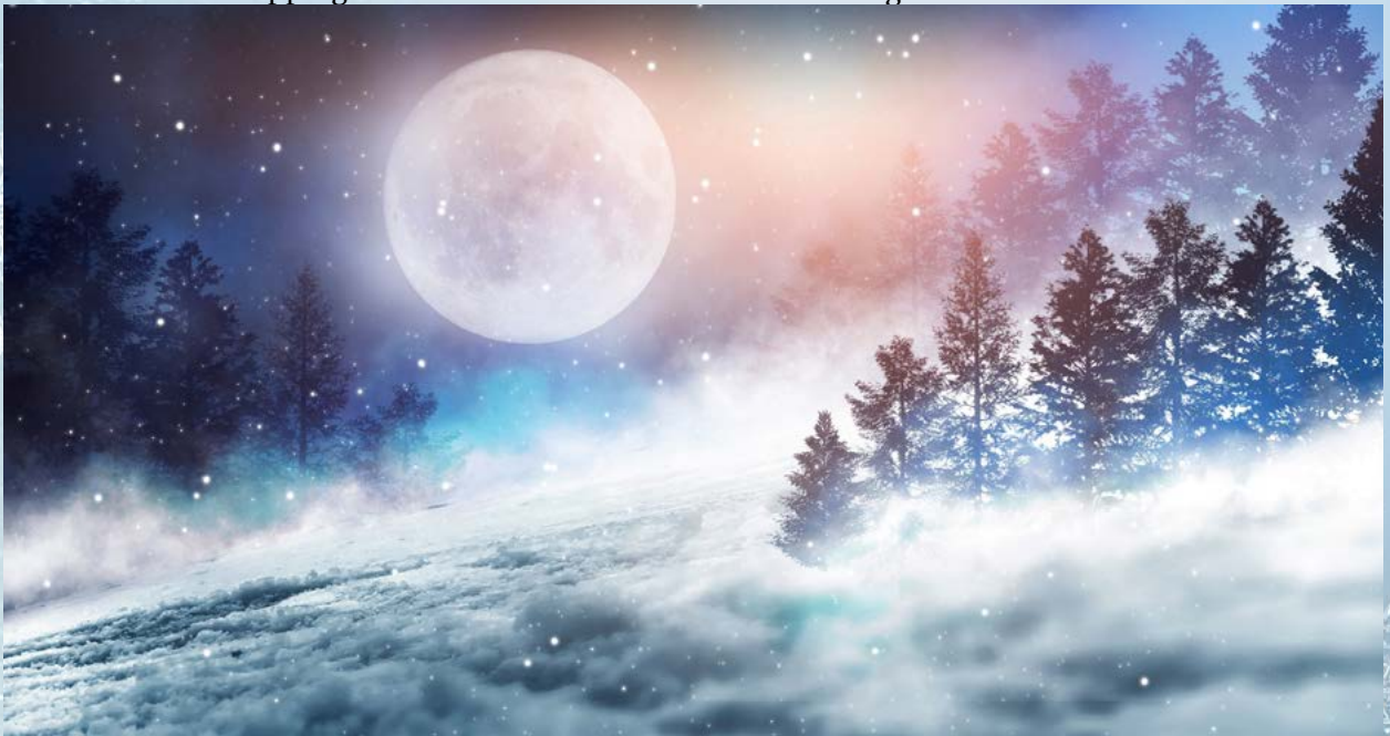
*article from www.almanac.com

In Europe, ancient pagans called the December full Moon the “Moon Before Yule,” in honor of the Yuletide festival celebrating the return of the sun heralded by winter solstice.