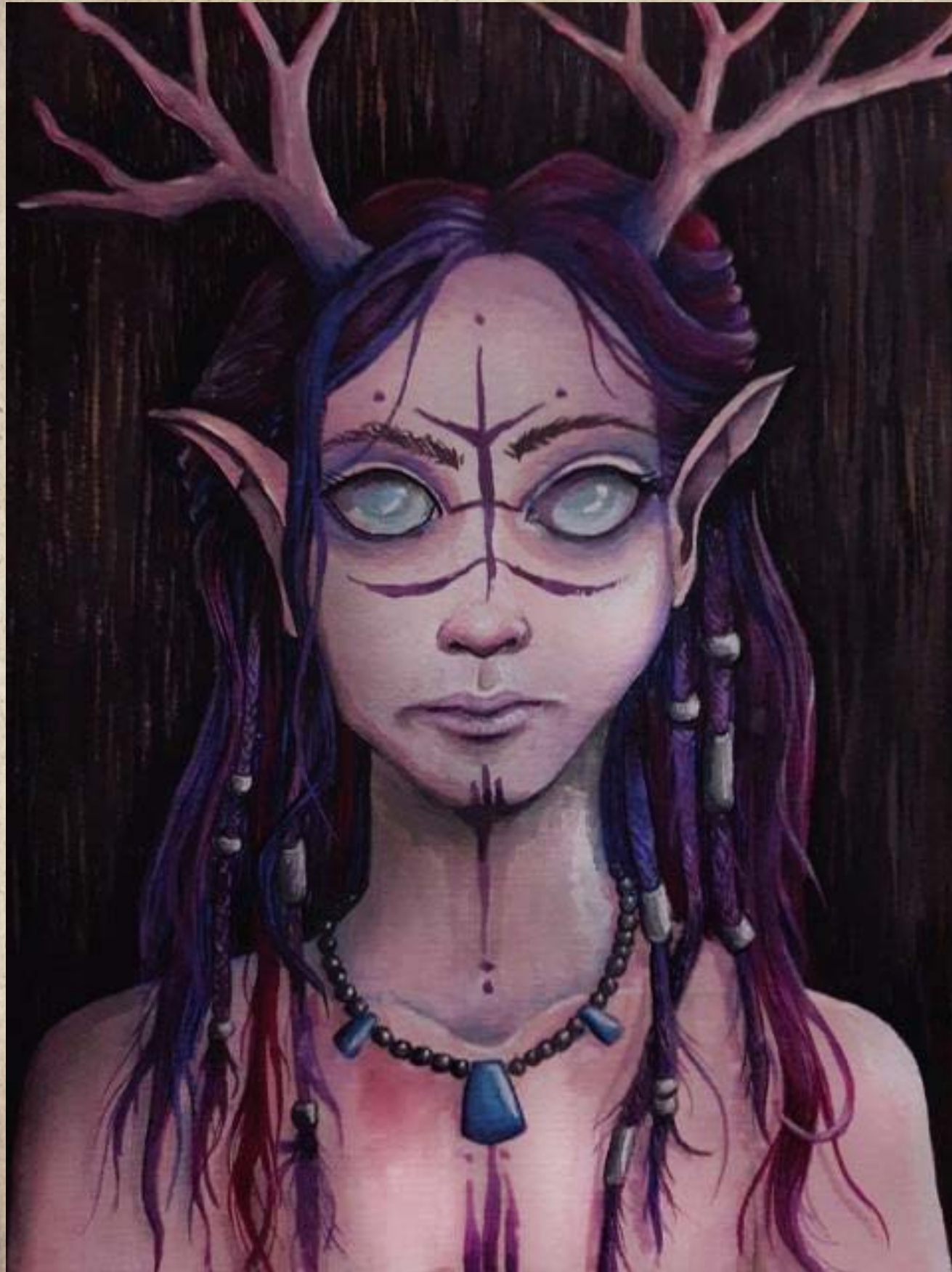
The Hunter Warrior by Sabrina RG Raven www.sabrinargraven.com